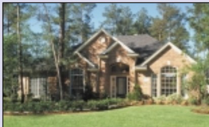
Emerald offers homes from their Classic Series priced from the $170s to $200s.

"We will create approximately 5,000 jobs within the community to encourage people to live here and work here," said Shadow