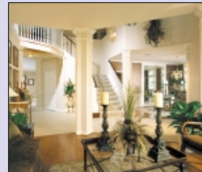
Shadow Creek Ranch features a variety of Perry Homes designs priced from the $220s to $260s.