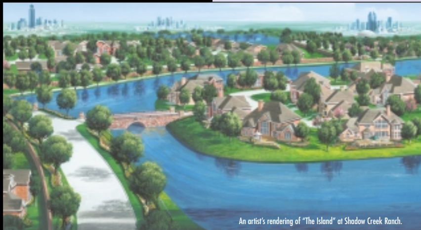
An artist's rendering of "The Island" at Shadow Creek Ranch.

A hiking and biking trail network of almost 22 miles will also traverse the property connecting the various villages and activity centers including parks, recreational facilities, retail and commercial facilities and schools.