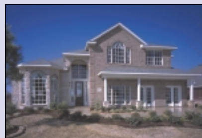
Legacy Homes offers home designs at Shadow Creek Ranch from the $140s to $220s.